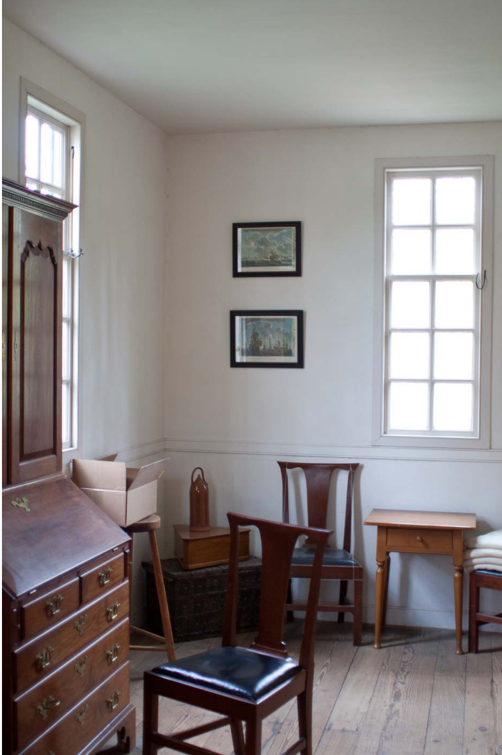
Reconstructed Counting Room Greenhow Store, Williamsburg Virginia Reconstructed - Colonial Williamsburg