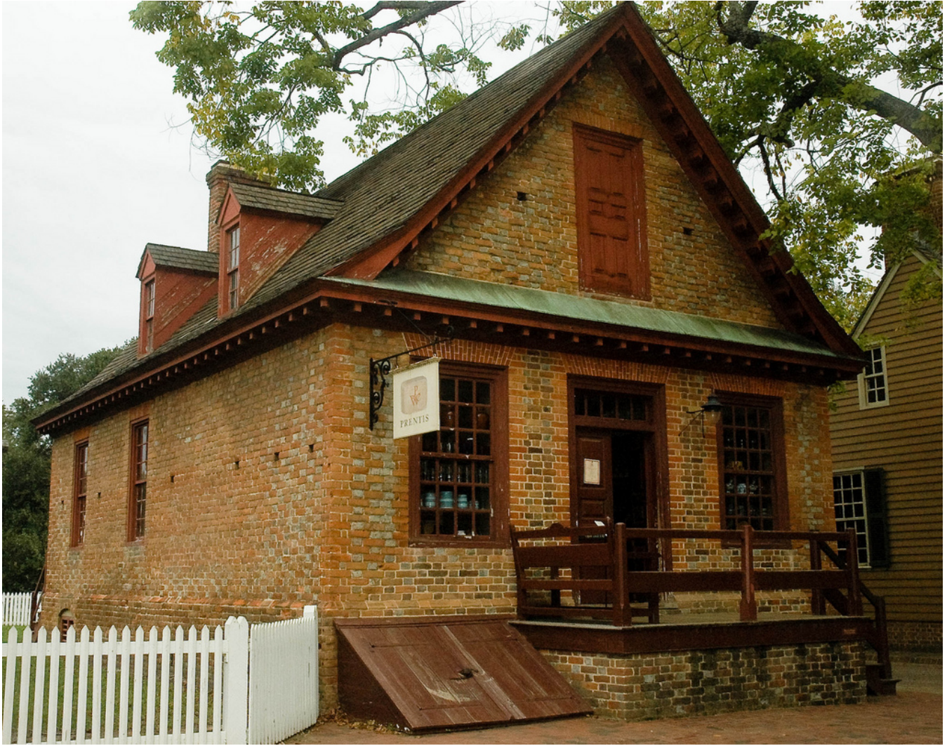
Prentis Store, Williamsburg, Virginia c.1740 - Restored by Colonial Williamsburg