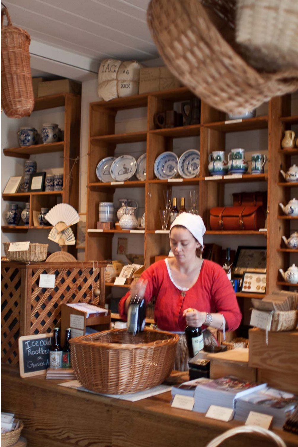
Storekeeper Behind the Counter Greenhow Store Williamsburg, Virginia Reconstructed - Colonial Williamsburg